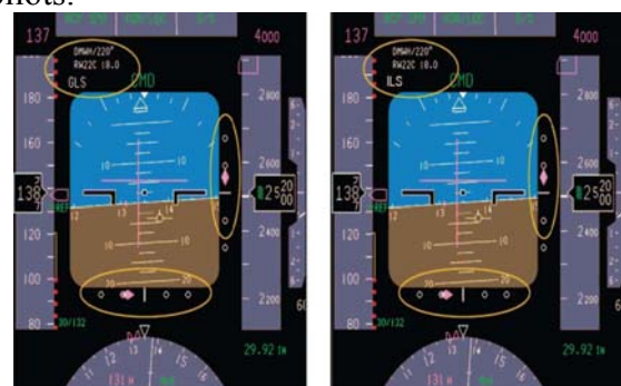
Figure 2 – GLS and ILS flight display

From a pilot's point of view, GBAS has been architected to work identically to ILS (figure 2). The only difference is the nomenclature the pilot sees on the display and, instead of tuning into a frequency, they now tune a channel to select a specific procedure. From a flying perspective, it is identical to ILS, which simplifies training. No specific simulator training or checking is required as pilots.